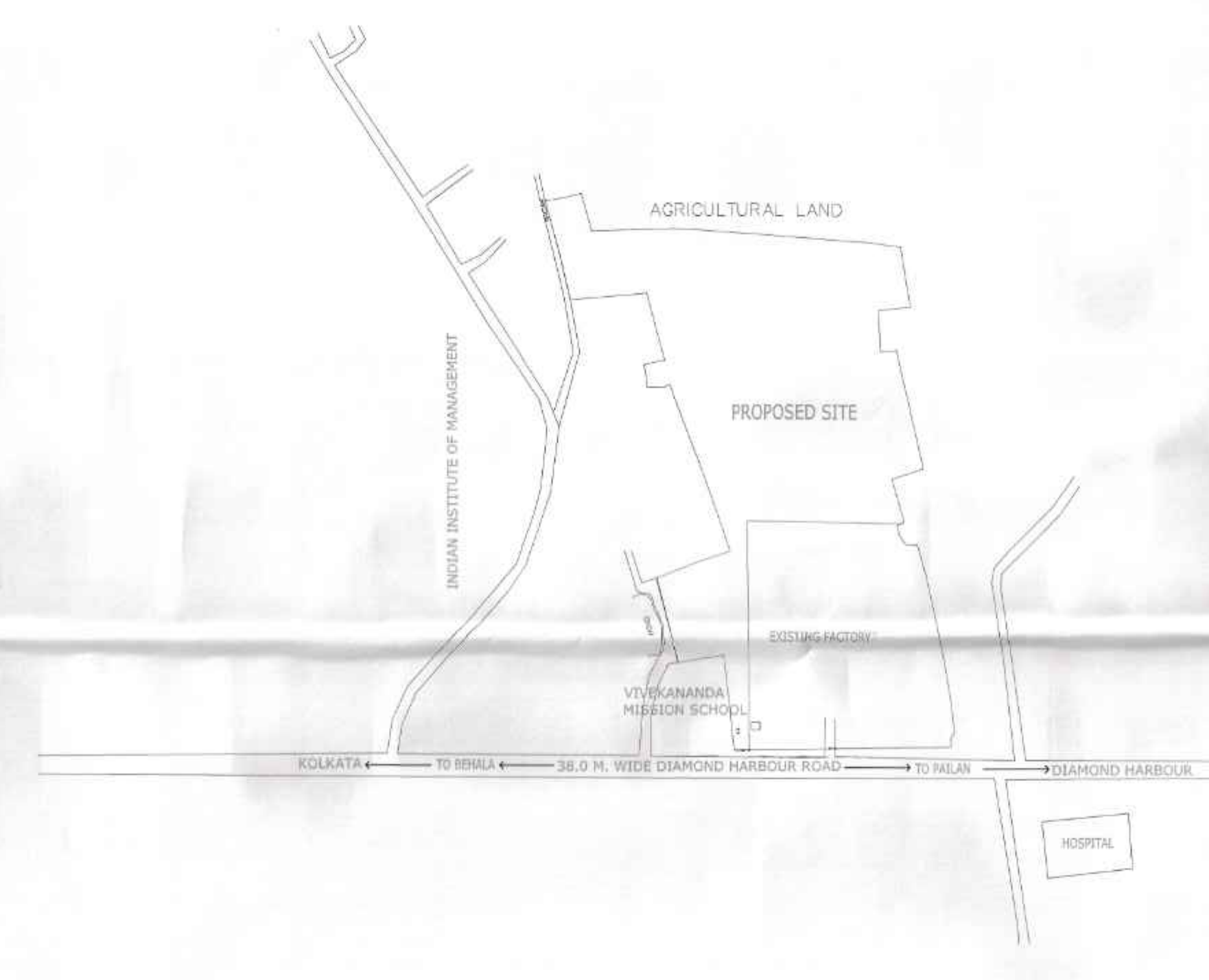
2 LOCATION PLAN 1:5000