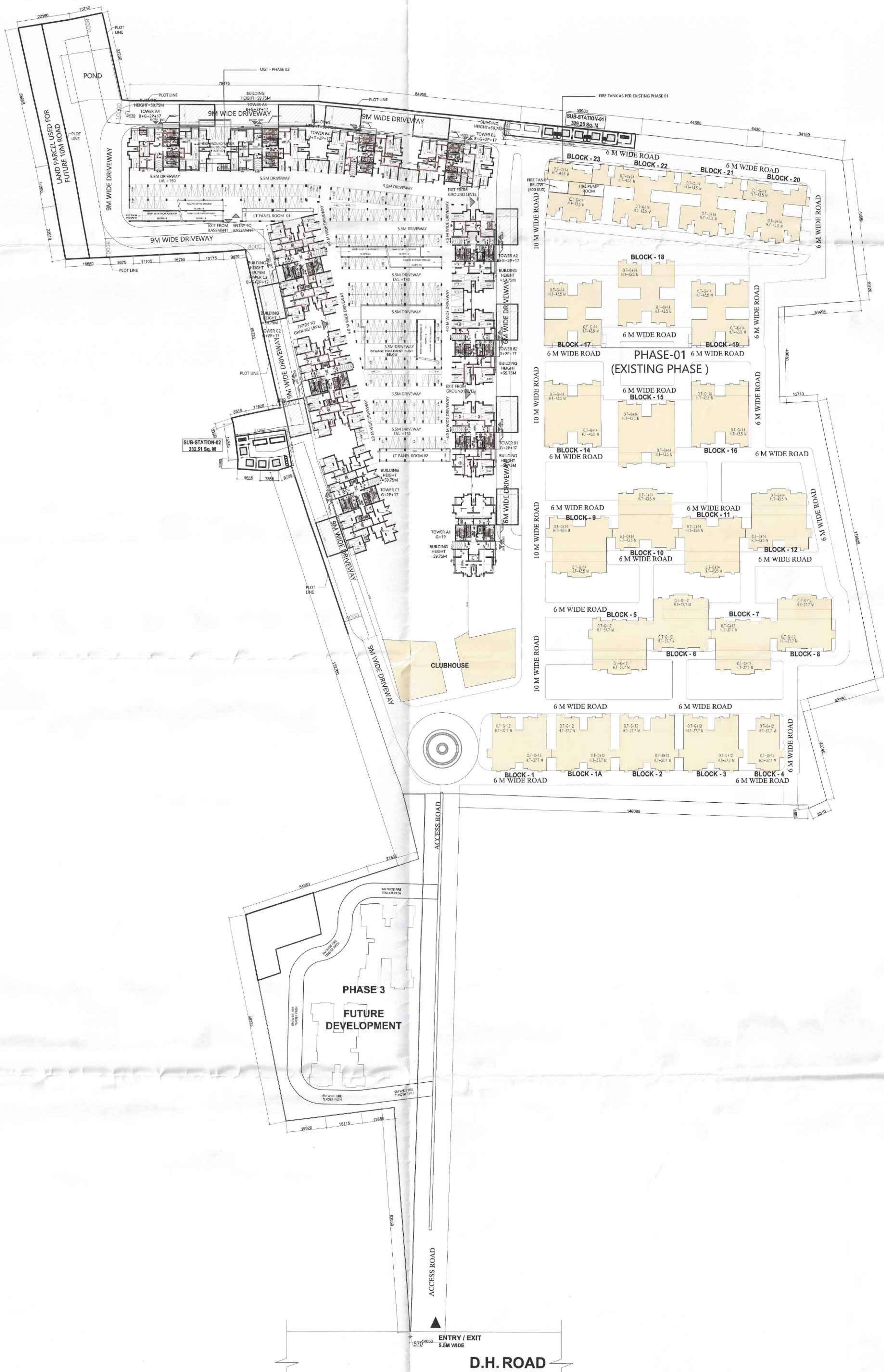
1 SITE PLAN - GROUND FLOOR PLAN 1:750